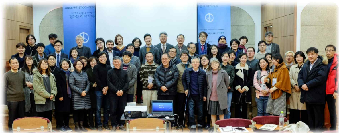
The 2 nd Anabaptist Conference on January 20: "Let's talk about Peace" featured by Israel Anabaptist, The Frontiers, Palestine Peace and Solidarity, The World Without War, Peace Song Writer, Korea Peace Institute, Korea Conflict Transformation Center, and Restorative Justice Center for School Teachers.

2) Ministry of church-planting – the Mennonite Seoul Meeting continues to study the Bible on a weekly basis. Two brothers started gathering in May 2017. Now there are 6 people who read and study the book of Revelations. We are following the schedule suggested in the book Apocalypse and Allegiance by Nelson Kraybill. In South Korea, many churches have lost their direction, and have even tasted bitterness as a church. But the church is an important body of Christ regardless of the situation. We would like to see our small group grow into a faithful church as is taught by the Bible.