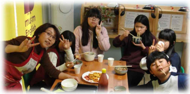
Winter vacation activity: enjoying making food and eating together